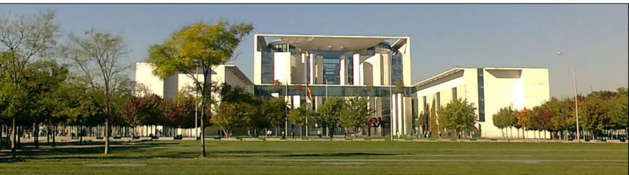
FIGURE 2 The Federal Chancellor’s Office

On this basis, an international urban design competition was organised. One of the main issues of the competition, held after the basic political decisions, was that parliament and government buildings should perform in a symbolic manner the values of the German democracy and of the German reunification. The Bundestag and the Bundeskanzleramt (the Federal Chancellor’s Office) should be located close together, to symbolise the co-operation between two main branches of public power, the legislative and the executive power. Another main issue was the character of Bundestag as a “ working parliament ”, needing a lot of adequate rooms for fractions, committees, and the staff of the MP’s, too.