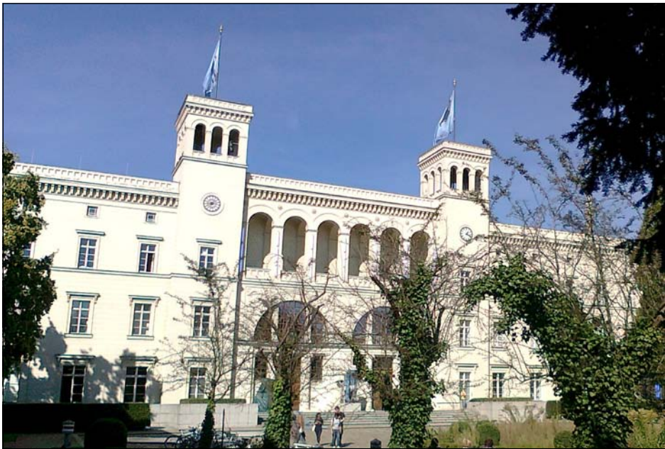
FIGURE 6 The former “Hamburger Bahnhof” (Hamburg Railway Station), now museum of contemporary art