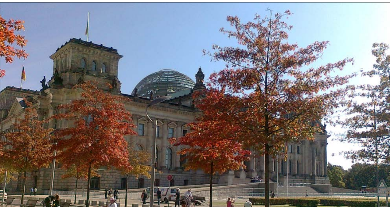
FIGURE 1 The Reichstag building

In 1991, the Bundestag took the basic political decision to move from Bonn to Berlin. The Bundesrat and the Federal Government followed. However, parts of the ministries still have their offices in Bonn, the provisional (West) German capital since 1949. The first presidential elections after the reunification were held in 1994 in the former Reichstag building, which became the new seat of the Bundestag.