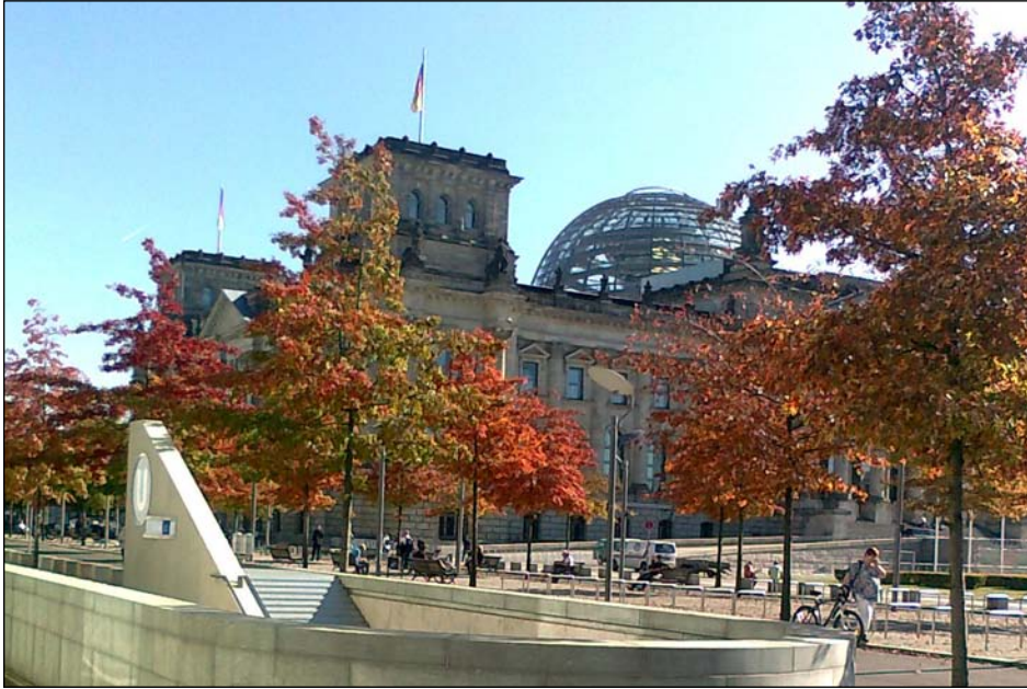
FIGURE 5 The Reichstag, seen from the entrance of the underground station